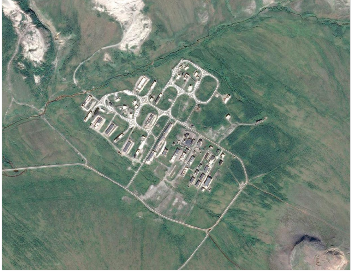
Ugoln'yy as it appears today.