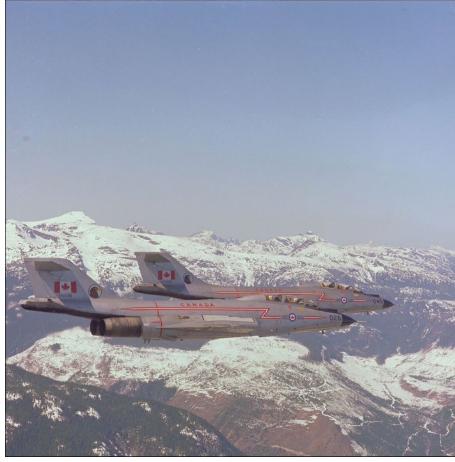
Two CF-101 Voodoos from 409 Squadron, Comox

The first target set was in Alaska. Strategic Air Command used Eielson Air Force Base for tanker support to the Airborne Alert force B-52 bombers orbiting over the Arctic. One of three Ballistic Missile Early Warning System (BMEWS) radars was situ-