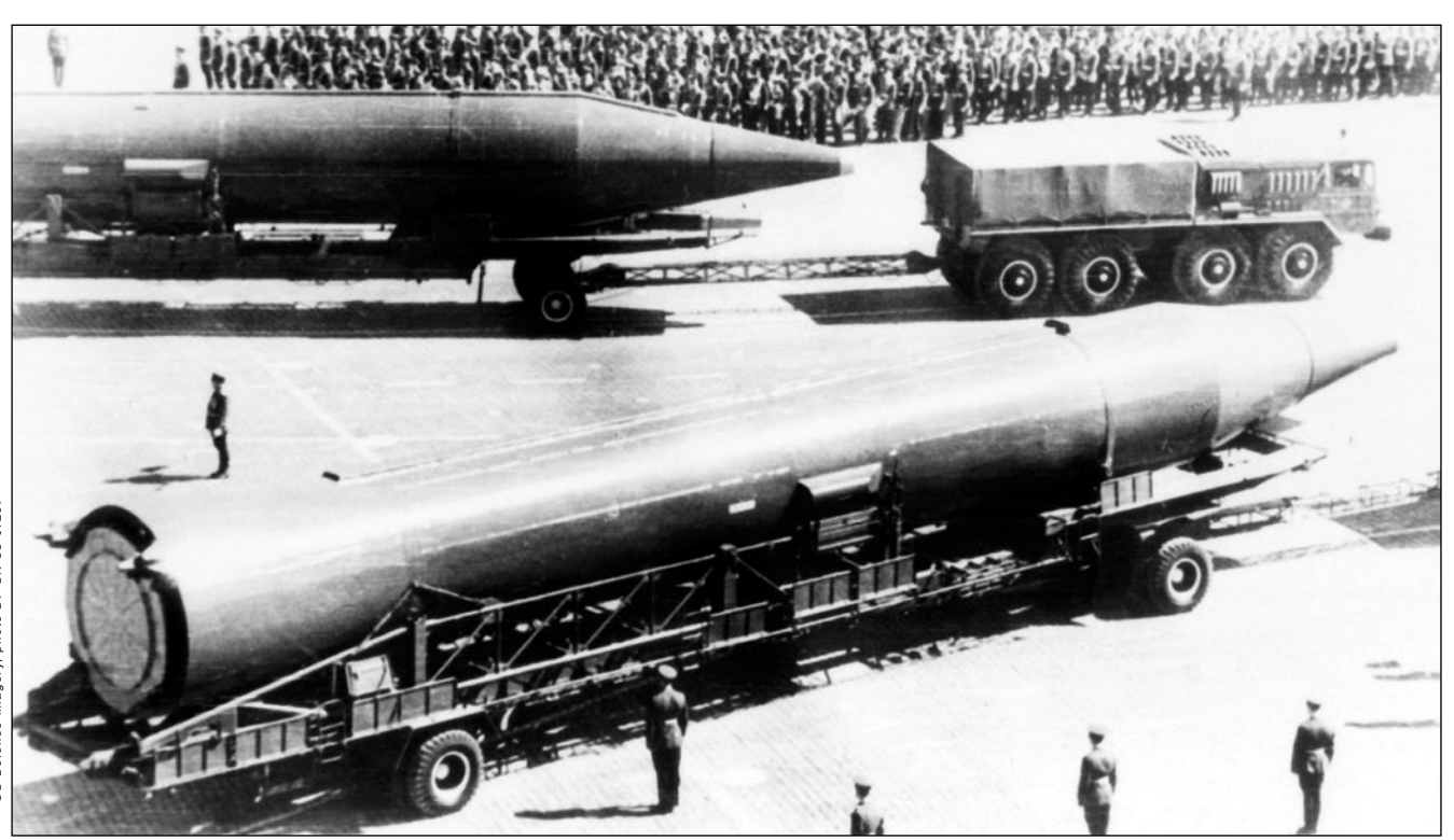
A right side view of two vehicle-mounted Soviet SS-5 Skean medium range ballistic missiles