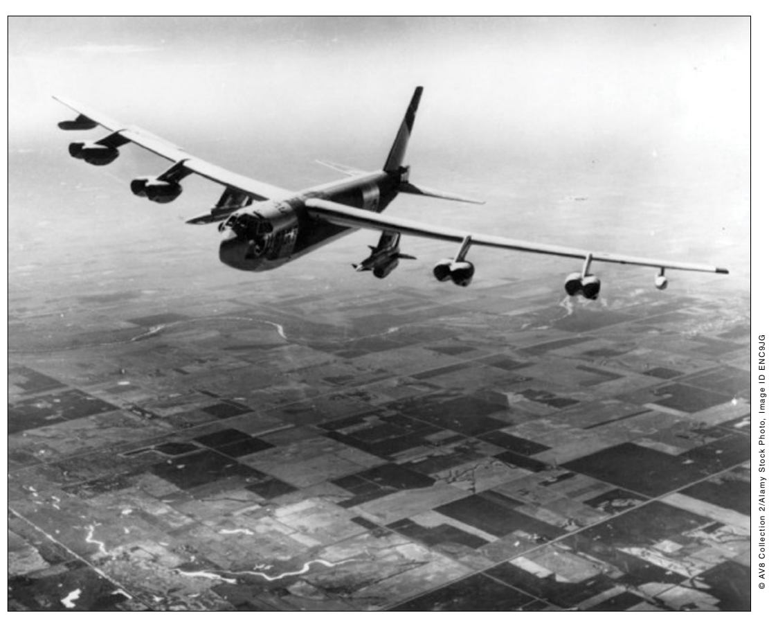
A B-52 Stratofortress with air launched Hound Dog cruise missiles under each wing