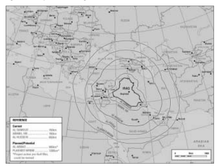
Figure 5: Iraqi Missile Ranges